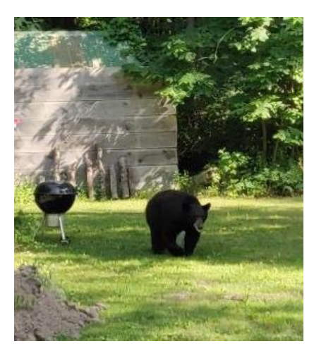
A bear (almost) crashing the Father's Day celebration at the Randolph/Piraino backyard.