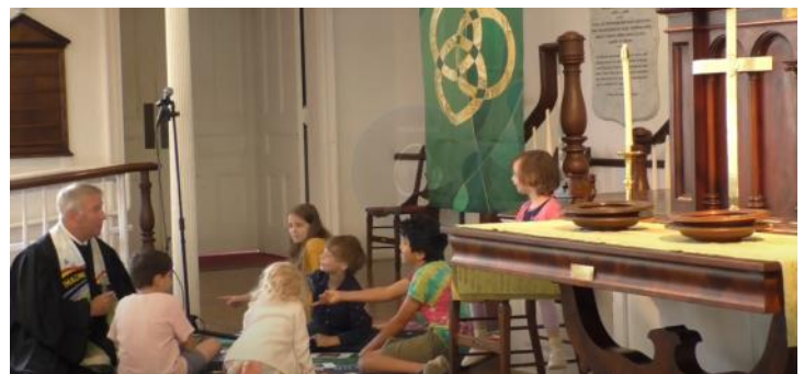
Kids Time, June 12

For job descriptions, please contact the church office.