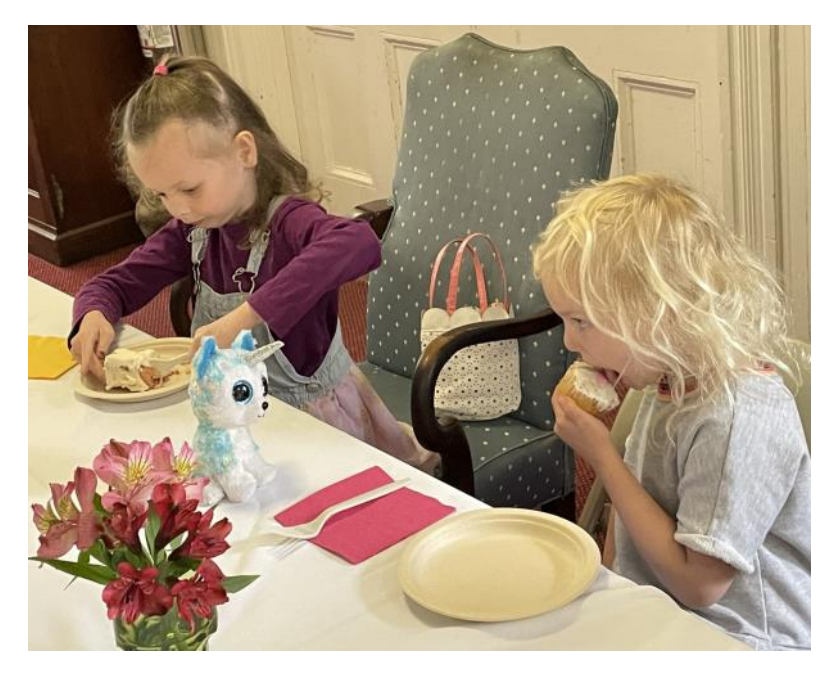
There were many cakes! All-Church Birthday was celebrated on May 21.