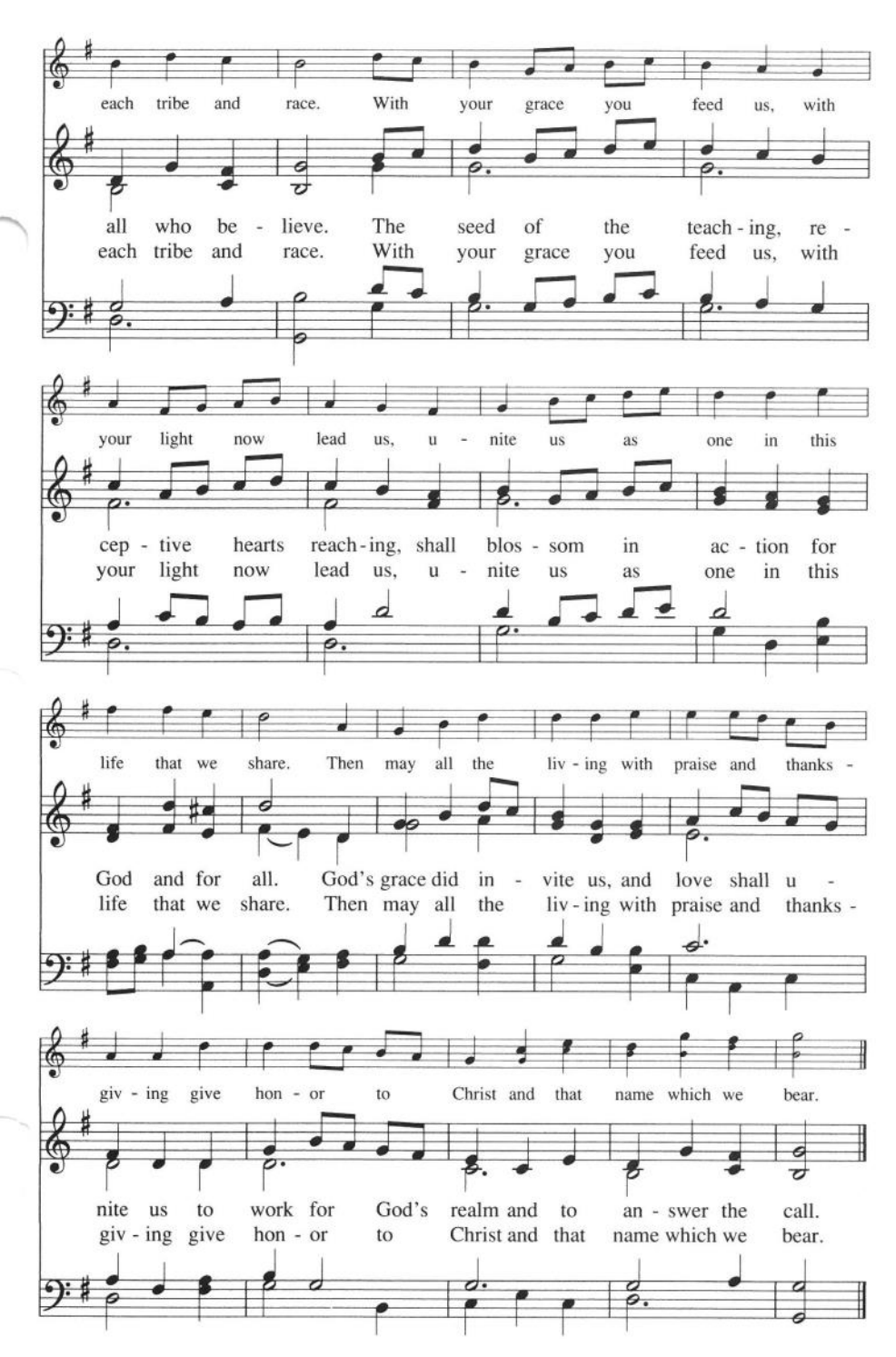
The New Century Hymnal (1995)