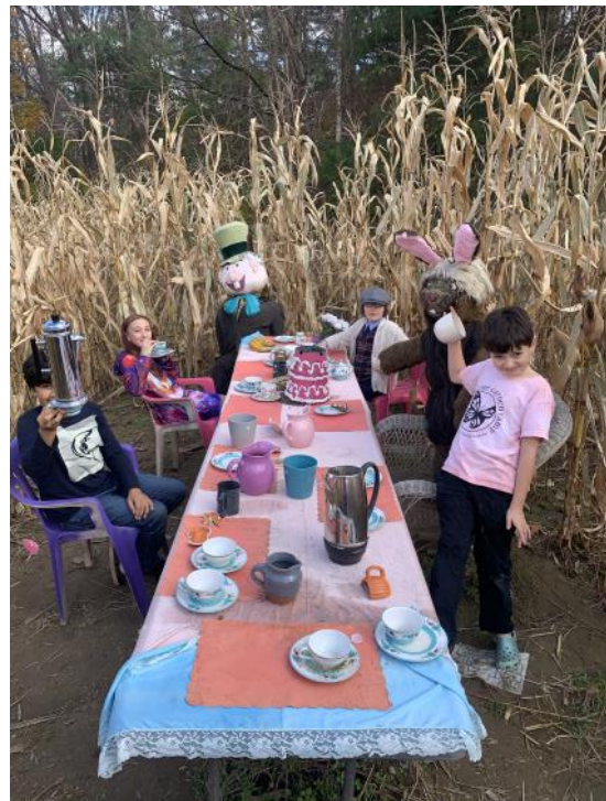
A variation on the theme of Coffee Hour. The Youth Group enjoyed a tea party at the Taft Farm Corn Maze, November 5.