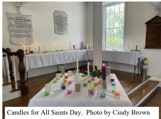
Candles for All Saints Day.

The Working Group expects to begin planning work early in 2024 to evaluate the suggestions we've received and assemble a prioritized scope of work, time frame and funding. This planning phase will take most of 2024 - to assess all the options, the costs and the available resources. There may yet be a role for you to get involved in this important project that serves the church and the community. Stay tuned for updates and information!