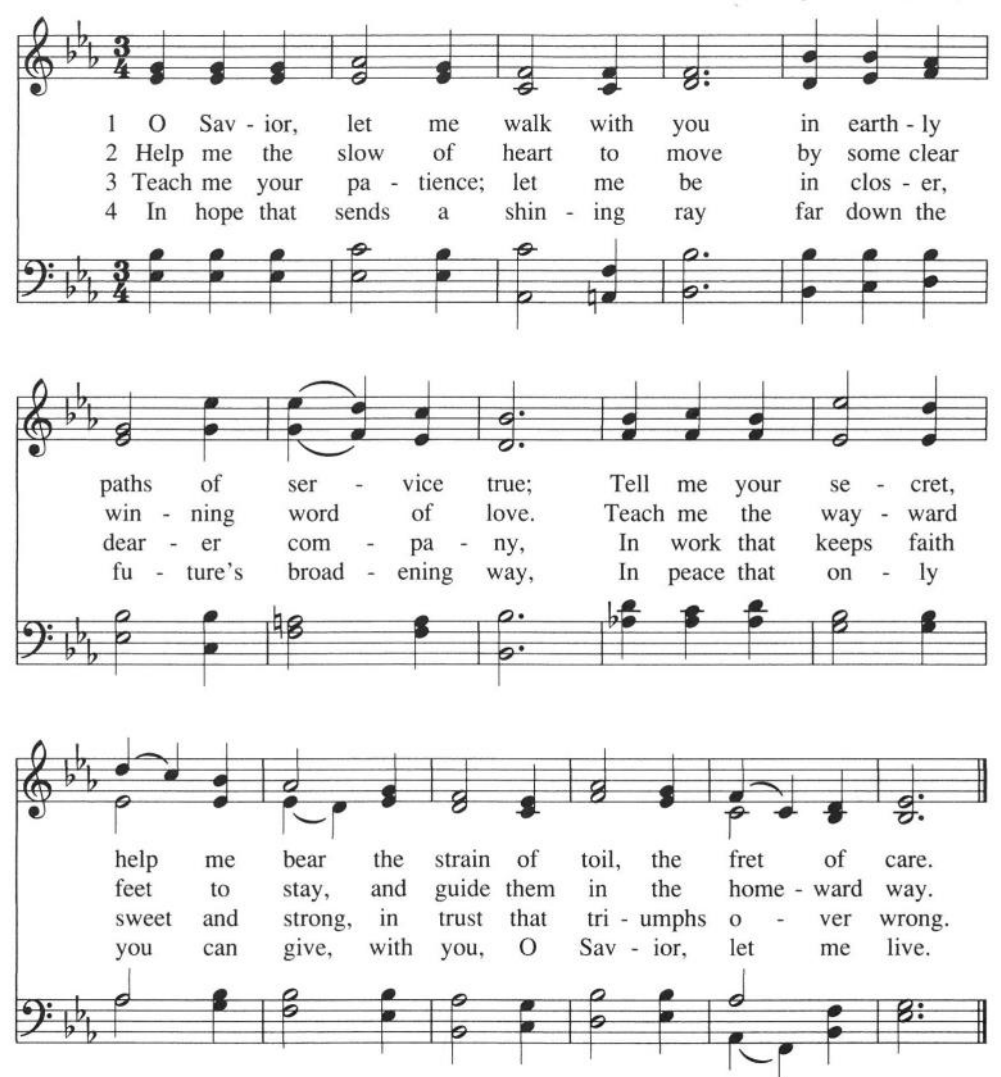
The New Century Hymnal (1995)