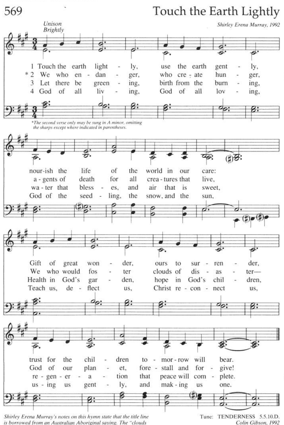
Shirley Erena Murray's notes on this hymn state that the title line is borrowed from an Australian Aboriginal saying. The "clouds of disaster" mentioned in stanza 2 refer to nuclear testing by France, which New Zealand has protested at the United Nations many times.