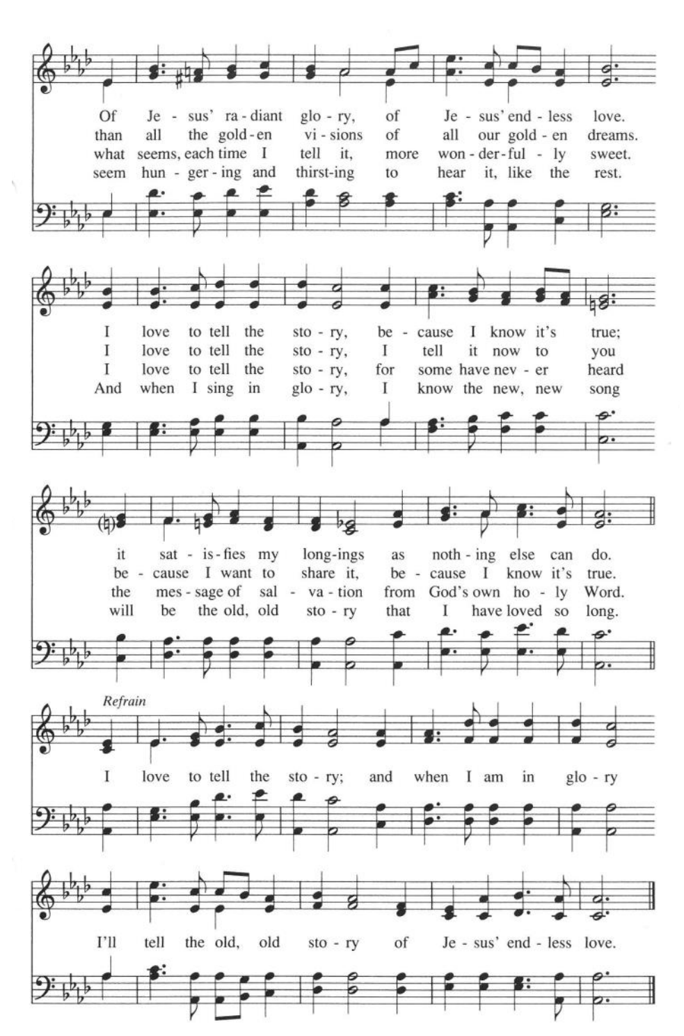
The New Century Hymnal (1995)